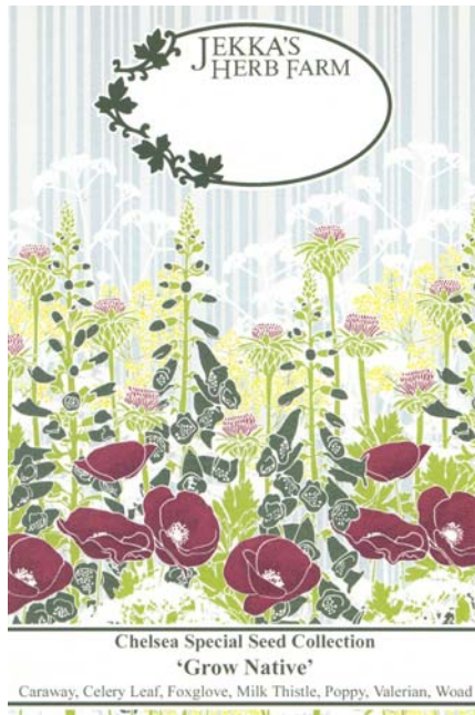
'Grow Native' Herb Seed Collection

show, which comprises 7 seed varieties, all of which are native to the UK: Caraway, Celery Leaf, Field Poppy, Foxglove, Milk Thistle, Valerian, and Woad.